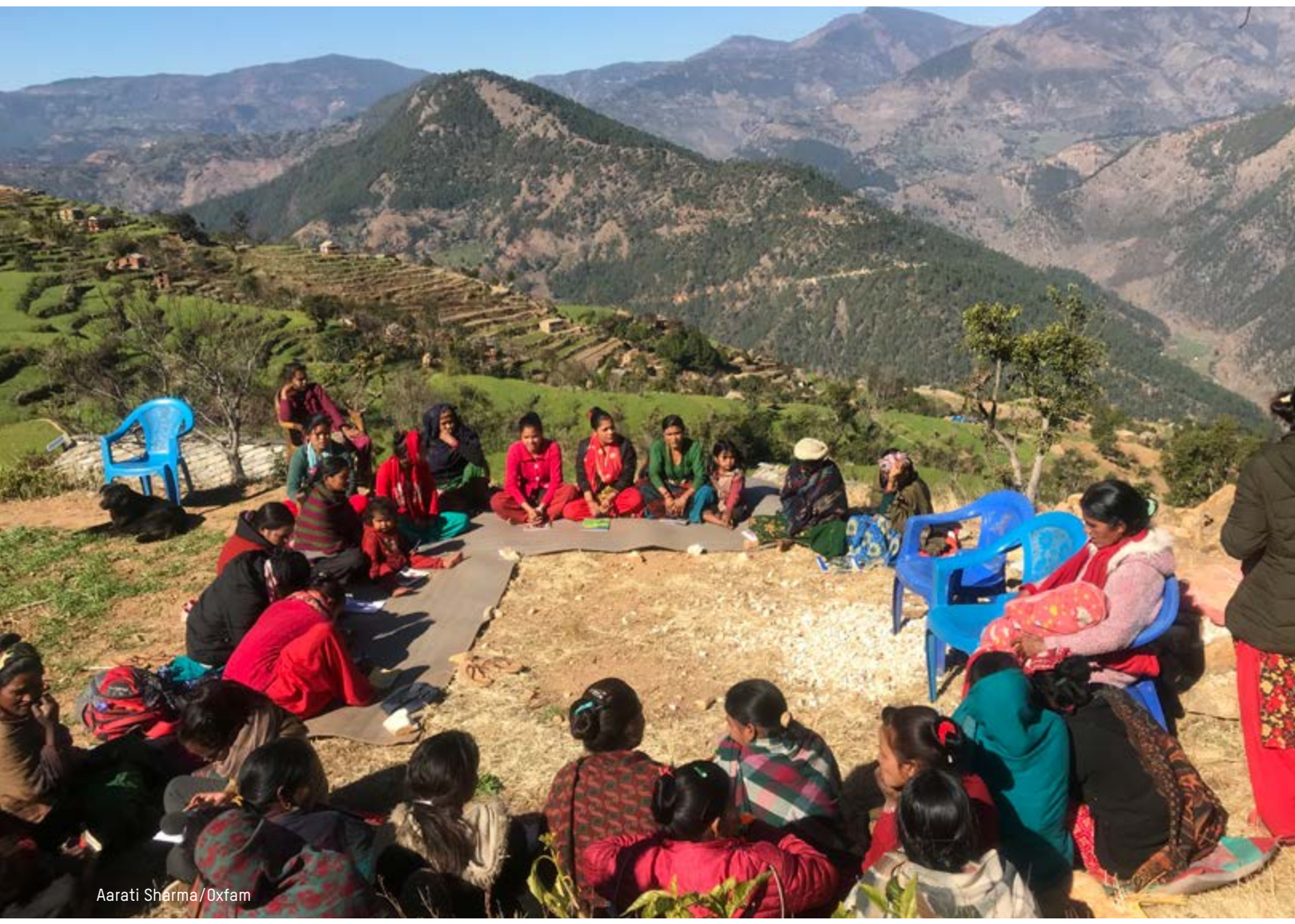
Women-led Community Discussion Center activities. Nepal.