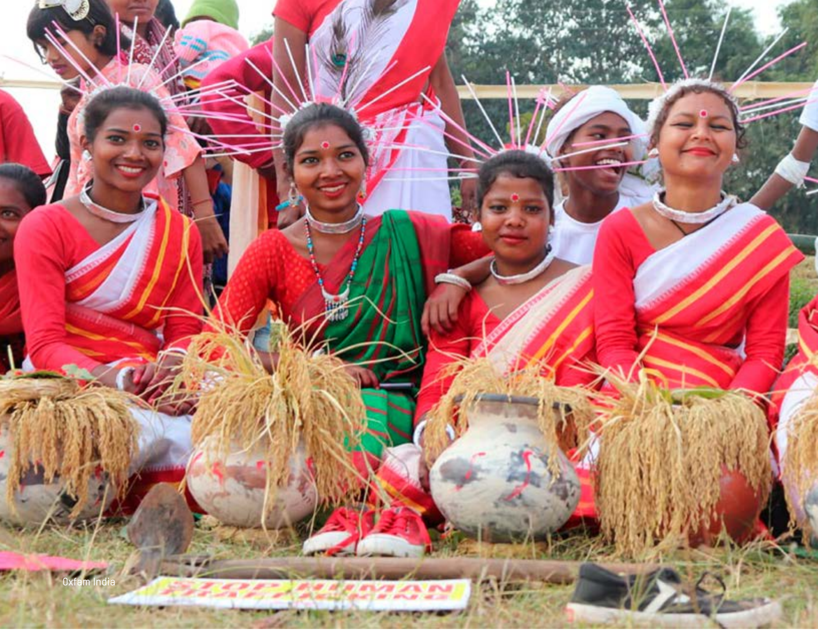
Cultural program: No marriage without consent, India.