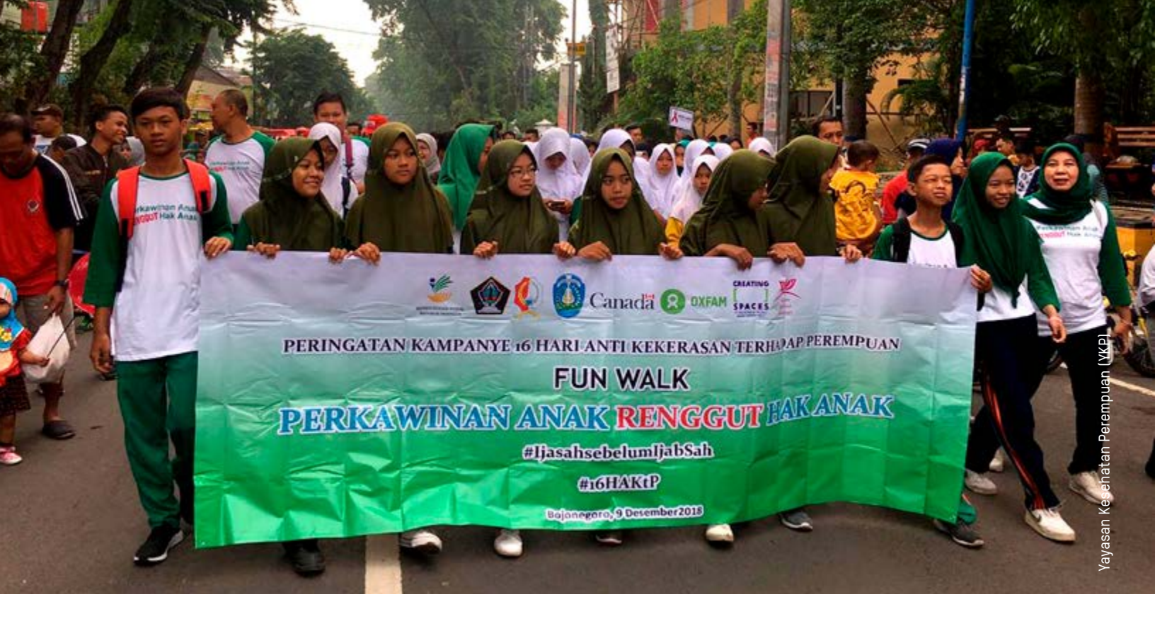
Enough Campaign in East Java during the 16 Days of Activism Against Gender-based Violence, Indonesia.

Various stakeholders participated in the research, including women participants and facilitators of the CDCs, religious leaders, local government representatives, and local NGOs engaged in influencing change. Learn more about the innovative feminist research approach used to carry out this study on page 13. The key research findings are highlighted in Box 8.