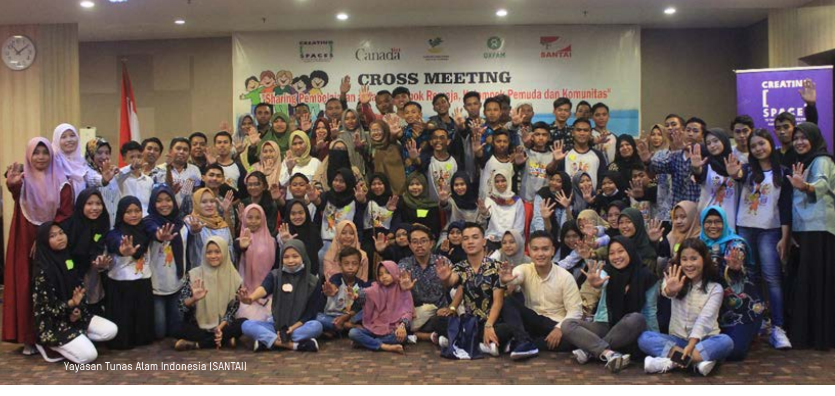
100 participants from the Youth Jambore event on VAWG and CEFM, Indonesia.