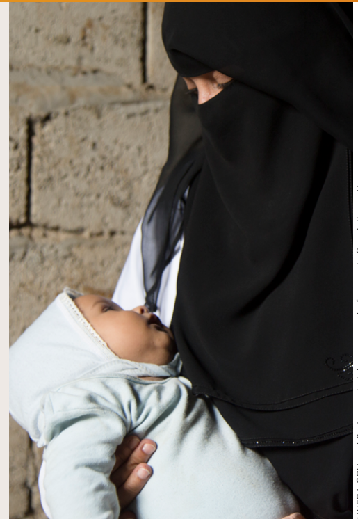
UNFPA SRHR mobile teams helping women before and after delivery, Yemen