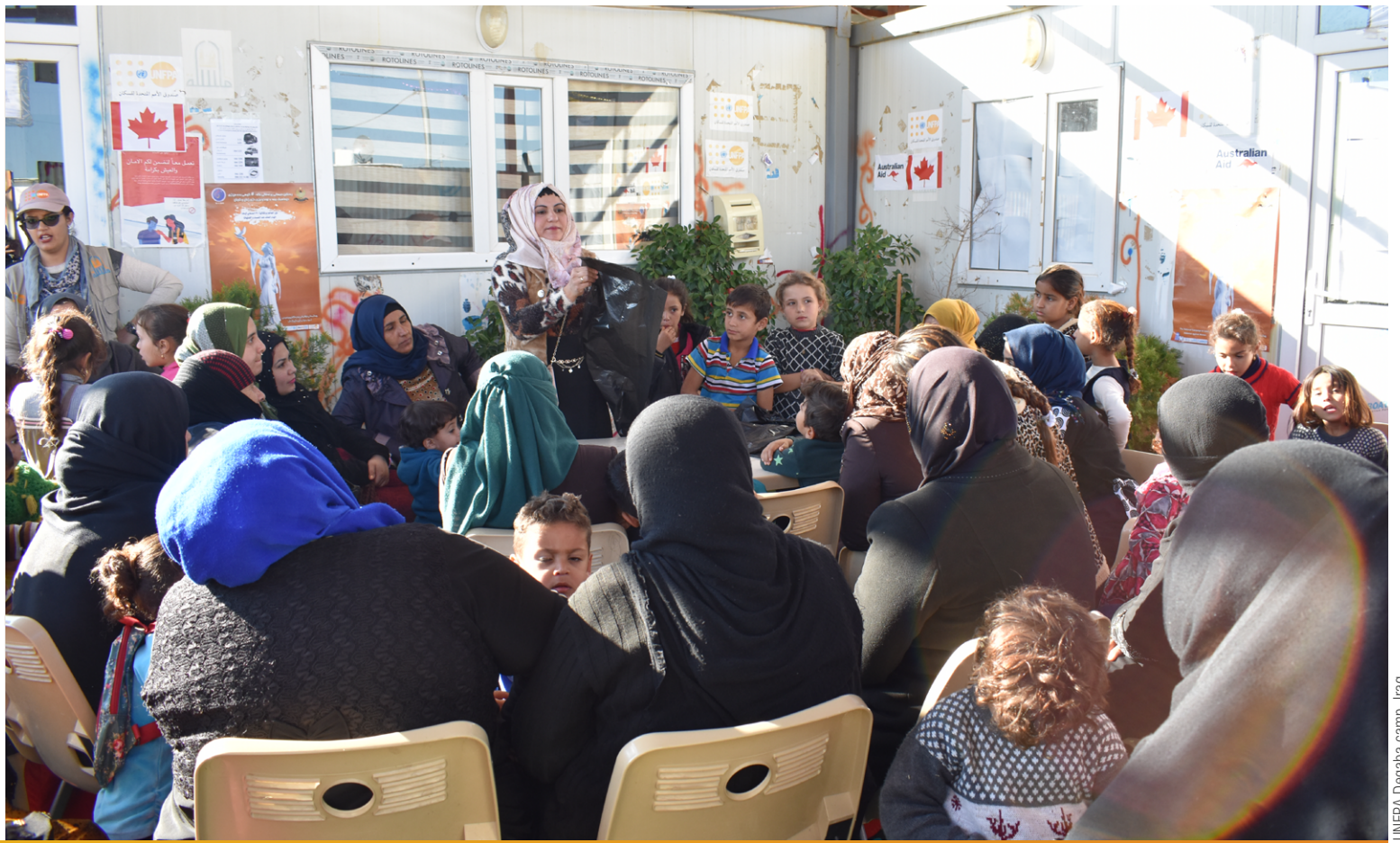
UNFPA Degaba camp, Iraq