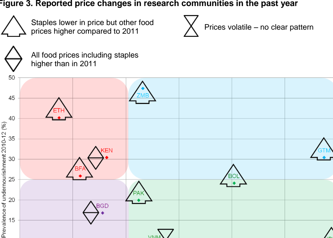
Figure 3. Reported price changes in research communities in the past year